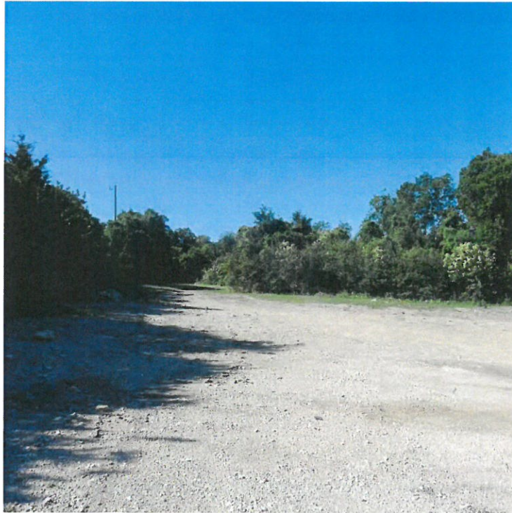
ACRE SUBJECT – WEST VIEW