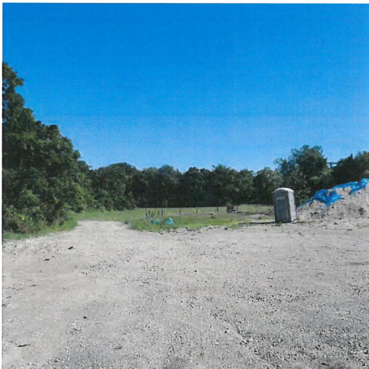
ACRE SUBJECT – NORTH VIEW