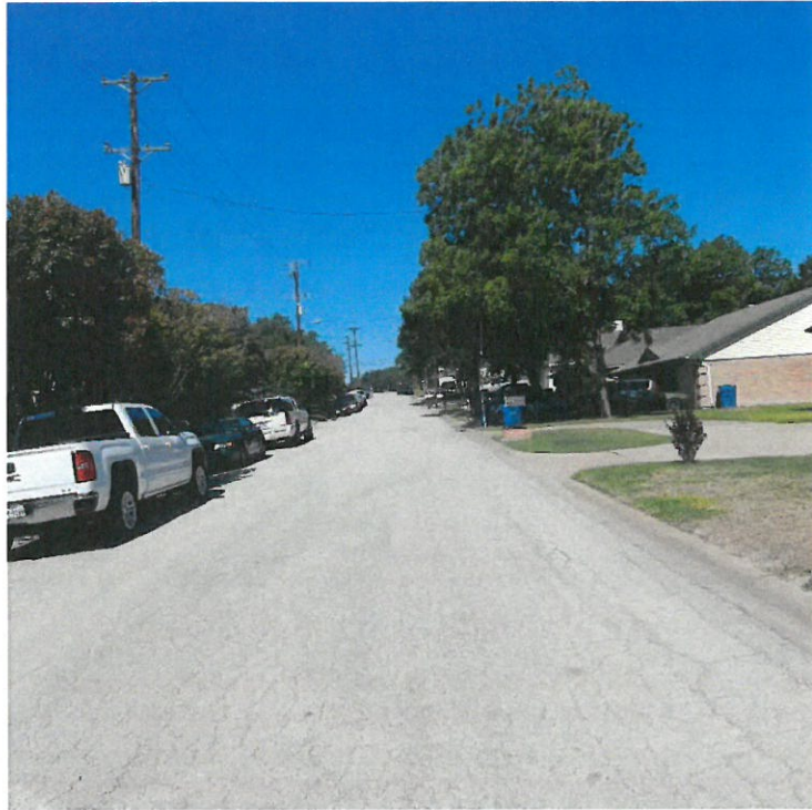
STREET SCENE – EAST VIEW ALONG HEATH STREET