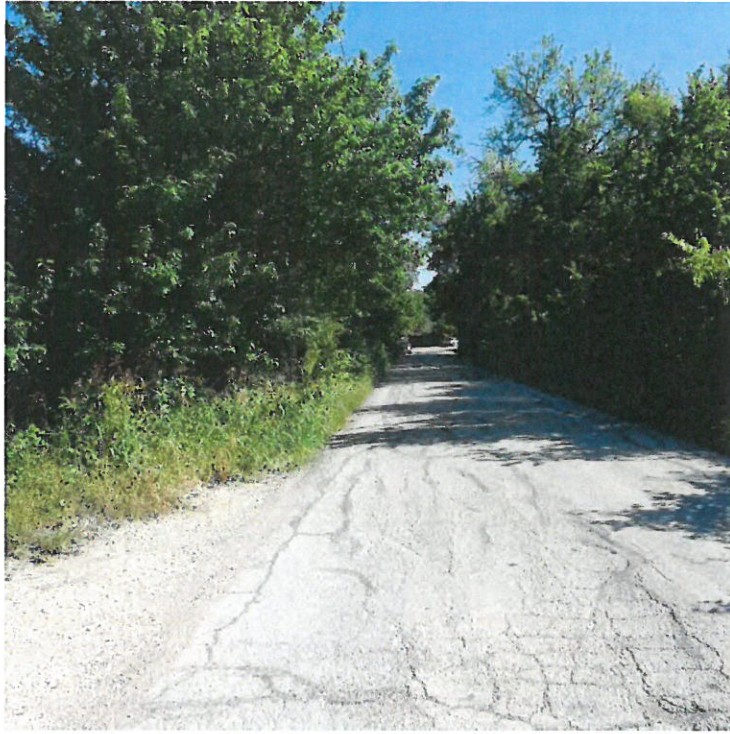
STREET SCENE - NORTH VIEW ALONG FANNIN STREET