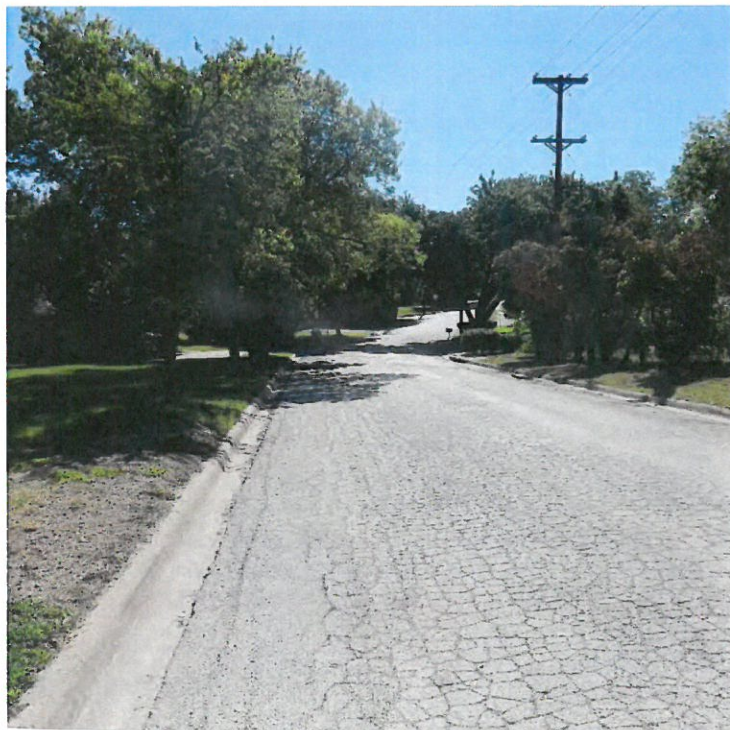
EAST VIEW ALONG HEATH STREET