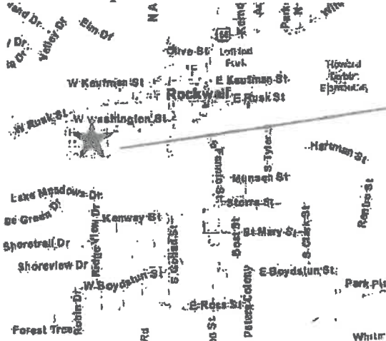
Rockwall Memorial Cemetery

Boundary shown in Detail Map is approximate. Refer to official deed and plat records for details: Deeds Vol. E, p. 58; Vol. U, p. 223; Vol. 11, p. 233; Vol. 34, p. 465; and Vol. 50, p. 617. Plats A-4 and B-352.