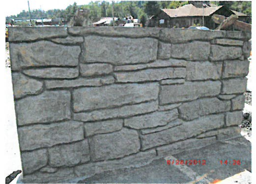
Concrete Form Liner Wall