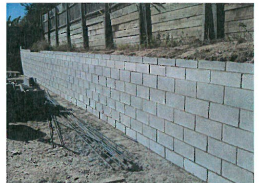
Smooth Face CMU Wall