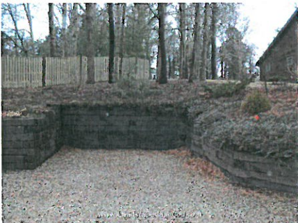
Railroad Tie/ Wood Wall