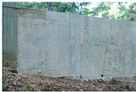
Smooth Concrete Wall